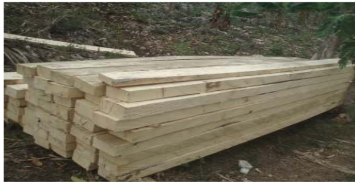
Figure 2. Sortimens of Candelnut wood.