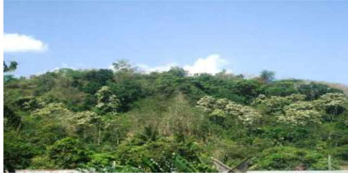
Figure 1. Candelnut community forest in Maros.